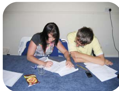
Interlink's Community Development Apprentices working towards their NVQ in Community Development