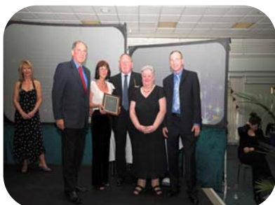
Community Cancer Care Service volunteers receiving their Volunteer Award from Dr Kim Howells MP at Interlink's Annual Volunteer Awards Dinner