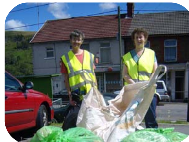
Members of Bryncynon Litter Picking group who received £4,372.98 from Interlink's Small Grant Scheme