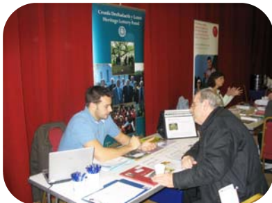
Interlink's Money and Advice Market, at Llantrisant Leisure Centre in April 2006